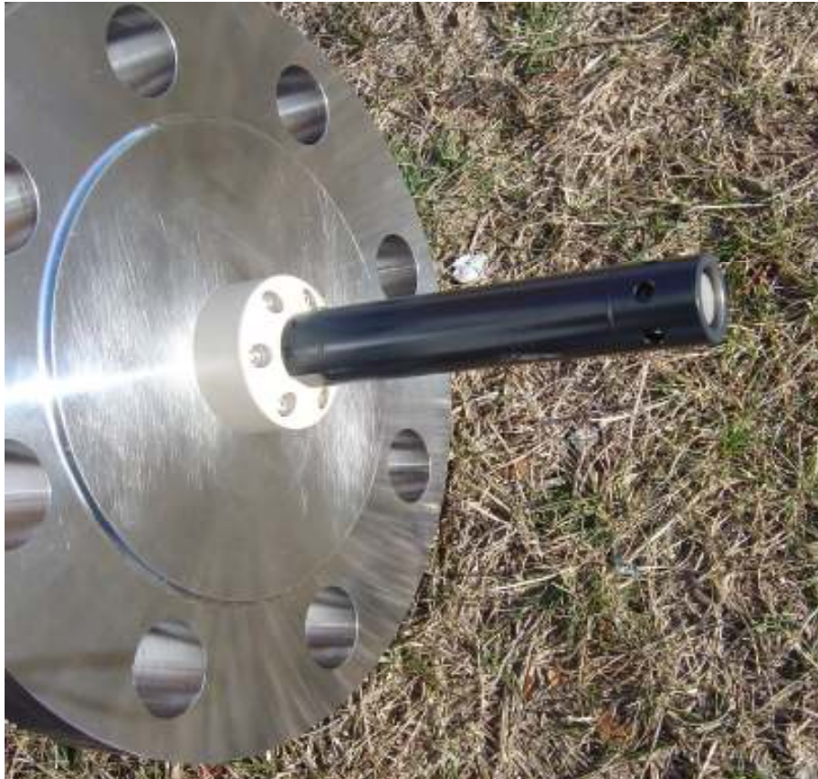
Figure 3 D-2 JF-1A-HP On-Line Fuel Sensor Element

The D-2 JF-1A-HP Conductivity Sensor with Flange Mount is shown in Figure 3. The unit is fully contained in a sealed approved housing. The sensor is designed to be fully intrinsically safe for operation in fuel facilities. The back cover allows for direct conduit connection to the meter and offers both 4 - 20 mA output and Serial Data Output Connections. The D-2 JF-1A-HP Conductivity Sensor can be operated as a "two wire" device under ISA 4 - 20 mA loop specification ANSI/ISA-12.12-1994 – Non-incendive Electrical Equipment for Use in Hazardous Locations.