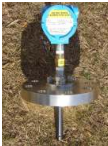
Figure 1 JF-1A-HP Sensor 2 ½" DIN 100 Flange