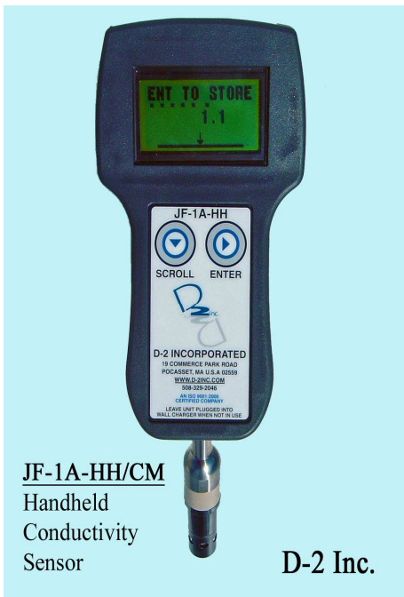
JF-1A-HH/CM Handheld Conductivity Sensor

in line sensor allowing the user to accurately test non-relaxed fluids. It has an easy to use menu system allowing up to 8 samples to be internally stored along with Sample Temperature, Date, and Time. D-2 offers a free Windows® XP software package for data acquisition and display. The software can synchronize with the JF-1A-HH when plugged into the USB port, and then can transfer data for long term record keeping on the PC.